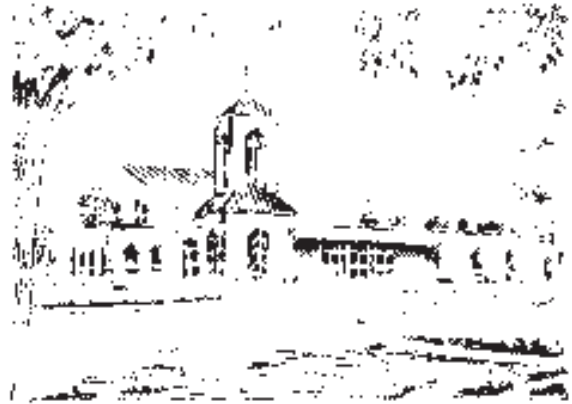
Our Lady of the Lake 129 Metro Road North, Keswick, ON L4P 3C8 Office: 905-476-0097 Fax: 905-476-0897